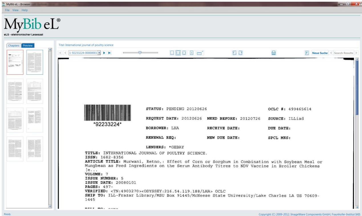
Fig. 3: Flyleaf of an unblurred preview navigation

You can use these options for checking if all ordered pages are included.