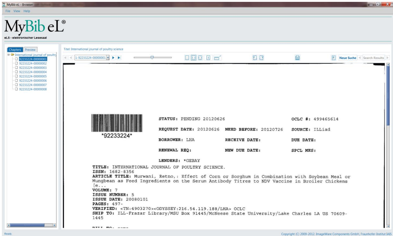
Fig. 2: Flyleaf and chapter navigation

The Chapter navigation bar provides clickable links to each page in the current document. Additionally, you can use the Preview bar to see unblurred thumbnails of all images included.