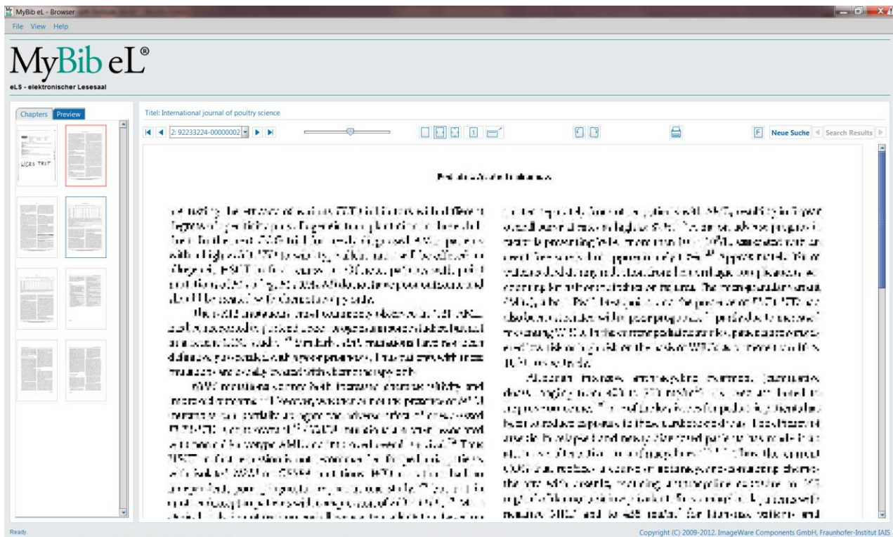
Fig. 1: Document in MyBib eL® with blurred pages

For copyright reasons all pages are blurred, except the first page. The first page is always the order flyleaf. Through the flyleaf you can quick-check the order data. The document title will be displayed right above the main window. The title is also displayed in the Chapters navigation bar on the left.